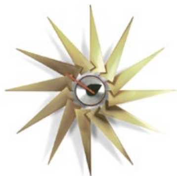
Turbine Clock, brass/aluminium, Ø 765