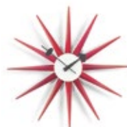
Sunburst Clock, red, Ø 470