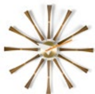
Spindle Clock, walnut/brass, Ø 577