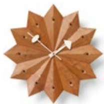
Fan Clock, cherry (USA), Ø 384