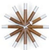
Wheel Clock, walnut/aluminium, Ø 455