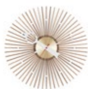
Popsicle Clock, walnut, Ø 350