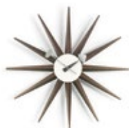
Sunburst Clock, walnut, Ø 470