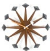
Polygon Clock, walnut, Ø 430