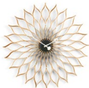
Sunflower Clock, birch, Ø 750