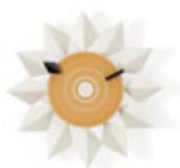
Diamond Markers Clock, white, Ø 335