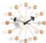
Ball Clock, beech, Ø 330